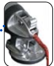
integrated line stopper