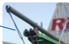
bridle kit (non delivered)